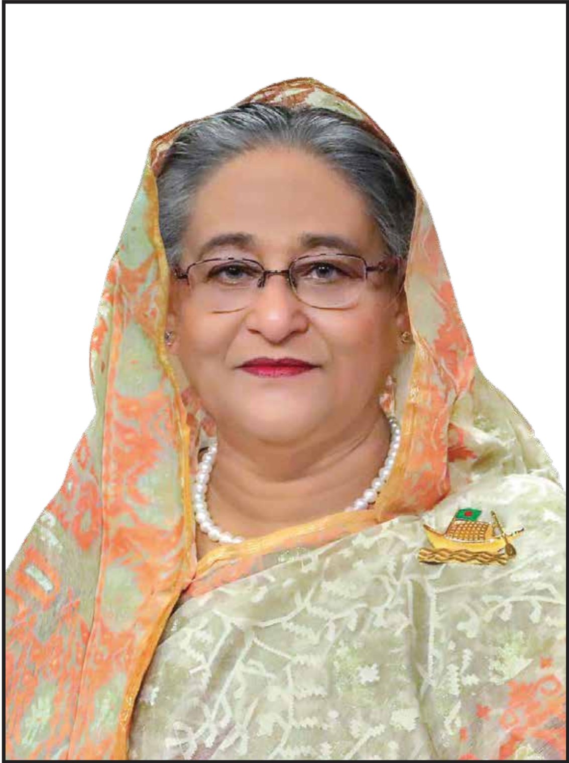
Prime Minister, Government of the People's Republic of Bangladesh